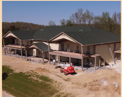
New Cedarmore Lodge opening summer 2026

These new lodges will allow us to serve an additional 5,400 students and group leaders every summer.