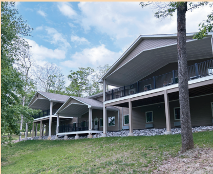
New Jonathan Creek Lodge opened summer 2025